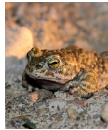
The Natterjack toad favours sun exposed ponds with sandy beds.