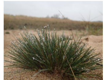
This unassuming tuft found on sandy grasslands may seem pretty insignificant, but it is a protected species in Burgundy! It is called the Grey hair-grass .