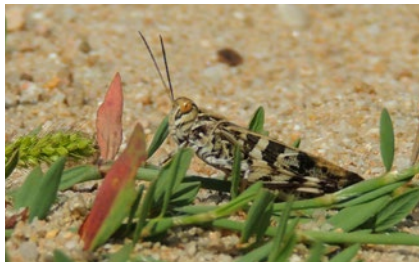
The Sulfur oedipod is fond of the dry and sandy grasslands of the Loire river banks. This cricket is well represented in the nature reserve despite being rare elsewhere in the region.

Many animal species live at the heart of this protected area, which is characterised by dry environments contrasted by wetlands. Here they find food, shelter and breeding sites.