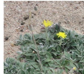
The Loire piloselle , similar to a dandelion, grows on sandy grasslands that are often redrawn by the course of the Loire river. This is an *endemic species to the Val de Loire area protected in Burgundy.

Plants with varied needs grow within the nature reserve. With changing life conditions that can go from extremes tied to the Loire river dynamics, some of them can survive both droughts and floods!